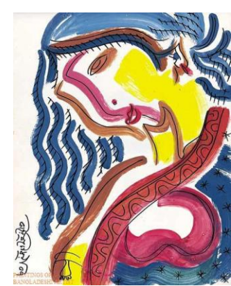
Collector International Center for Arts a contemporary art gallery [13],[14]

Oavvum Chowdhury has been ruling the art arena of Bengal for the last six-decade, since the era of the early 50s. As a renowned painting talent of the subcontinent, observing his above paintings we have seen his apply of Bold lines, geometric blocks, and variegated strokes and dabs of vibrant colors, including red, green, yellow, blue, purple, white, and black. He has often dominated the abstract expressionist settings with a deep sense of patriotism and down-to-earth modesty. In his work, the artist has used a variety of themes and topics in his artworks most of which have included typical Bengali settings of rural landscapes and beautiful scenic backdrops. The lush greenery of Bengal has always been the preferred choice of artist Qayyum Chowdhury with boats, rivers, sky, birds, tree lines, and semi-realistic figurations of common village folks including fishermen, farmers, communities of skilled craftsmen[16].